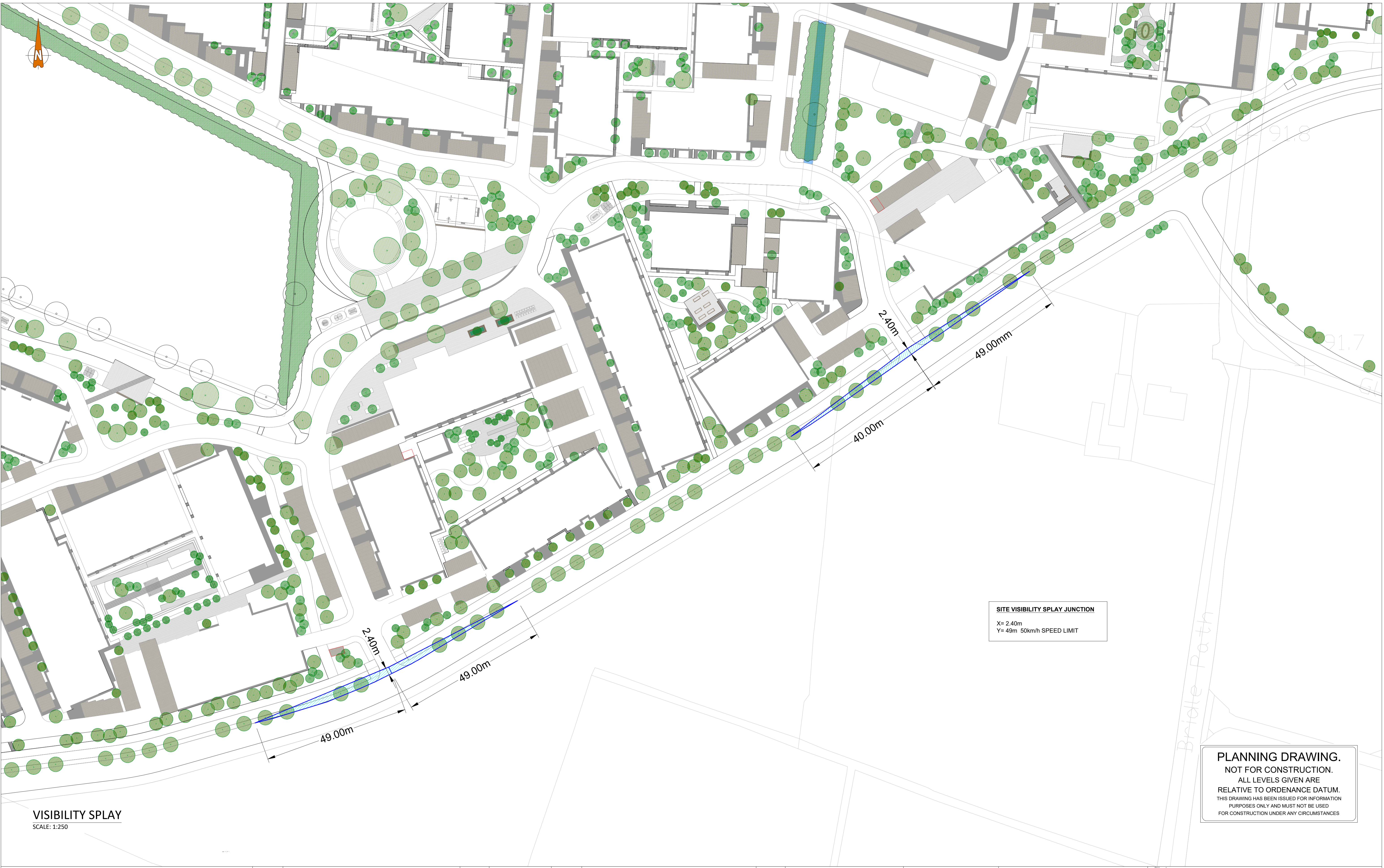
VISIBILITY SPLAY SCALE: 1:250

SITE VISIBILITY SPLAY JUNCTION X= 2.40m Y= 49m 50km/h SPEED LIMIT